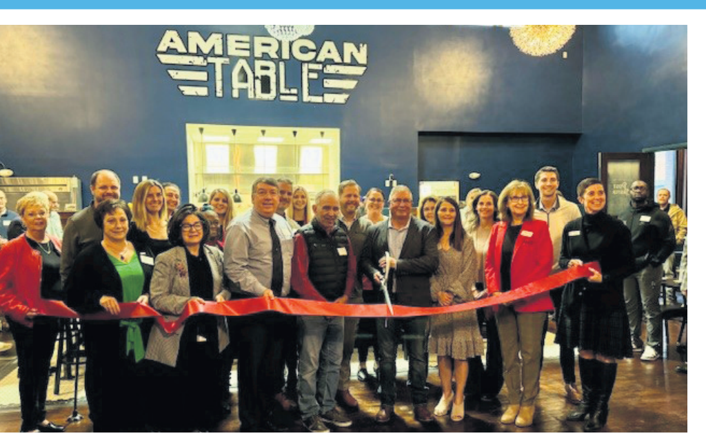
The Mahaska Chamber Diplomats were thrilled to join the Grand